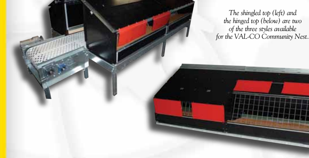
The Community Nest from VAL-CO is very inviting to your birds.

features a gently sloped top which increases bird space in your house.