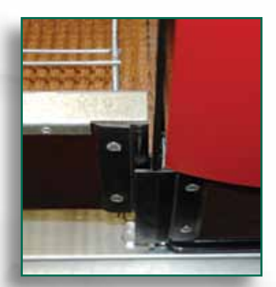
With slide together components, assembly is simple.