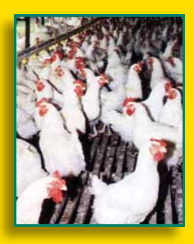
VAL-CO® can supply you with Watering & Feeding to help complete your system.