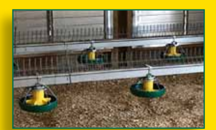
The Hanging Pan Feeders easily retrofit onto existing Flat Chain Feeding Systems.

Phone: (+1) 419-678-8731 Fax: (+1) 419-678-2200 E-mail: intl.sales@val-co.com