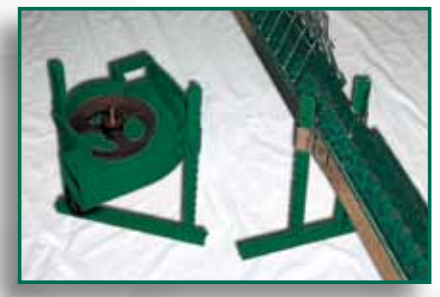
Floor stands offer wide footing to keep the trough and corners secure and properly aligned. Height is fully adjustable.

(WARNING: Corner cover is removed to show internal parts. The corner cover MUST be secured in place before system is operated.)