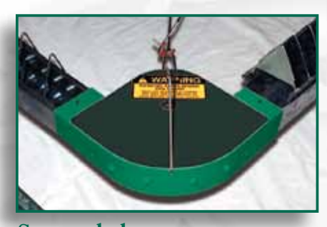
Suspended corner assembly and trough corners. VAL-CO corners have fluted wheel with oil impregnated brass bushing for long life.